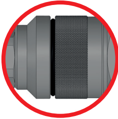
PARTIALLY CONNECTED INCORRECT